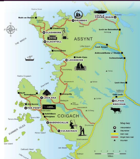
Heritage Trail Map