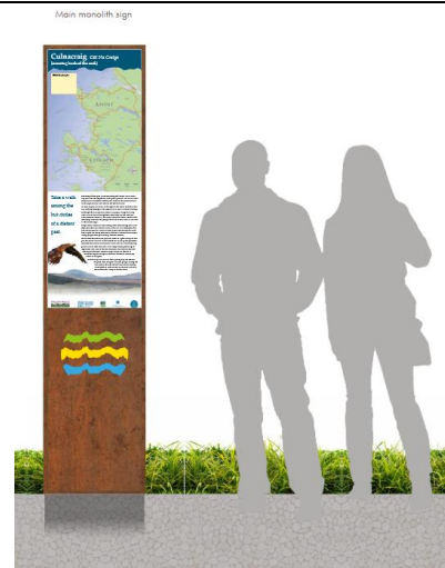
Example of Heritage Trail 'Monolith'