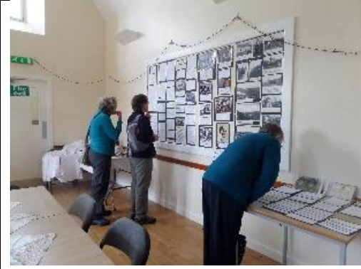
Drumbeg Community Hall celebrate 140 year anniversary of Drumbeg School