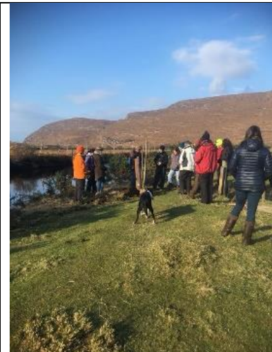
Students learning about fencing