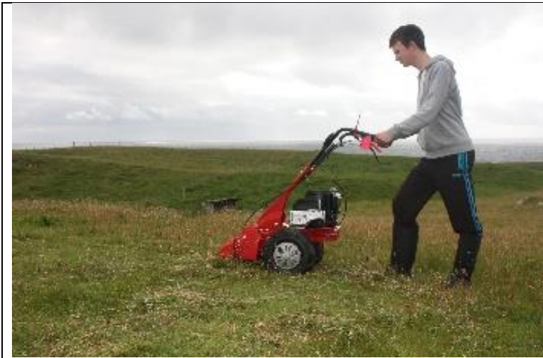
Power scythe being used on Clachtoll Common Grazings