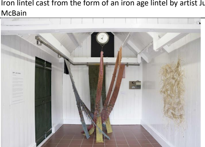
Fabric installation by Clara Elliot © C Elliot