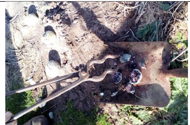
Copper nuggets broken from slag after copper smelting demonstration by artist Julia Cowie